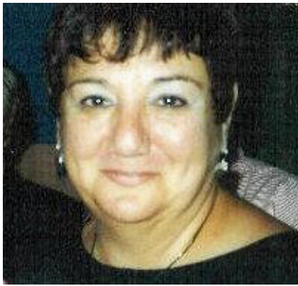
SuZen The Life Coaching Center